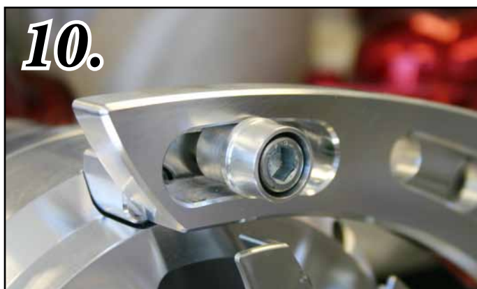
Fig. 10. In the upper Alternator and Power Steering slots use the two (MM100) Alum. Bolt bushings and the (2) \frac{5}{16} x 1" (S146)