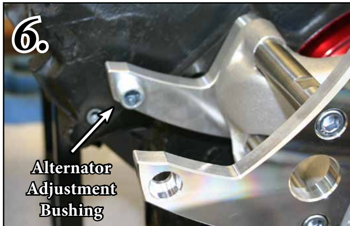
Fig. 6. Install the Adjustment Bushing (S450) into the rear Alt Support.