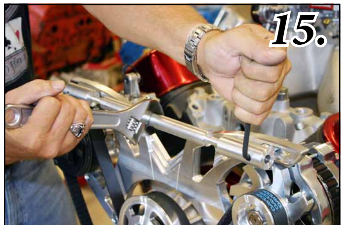
Fig. 15. Slip the supplied March Adjustment tool (21206) over the two (MM100) bushings. Use a wrench to turn the adjustment tool outward to tighten the serpentine belt to 100 ft. lbs. Use the holes in the adjustment tool to tighten both M8 socket head cap screws when correct belt tension has been achieved. Remove the adjustment tool and keep for future use.

Fig. 14. Push the Alternator and A/C inward to their fullest position and Install a 64" belt belt.