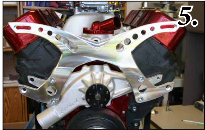
Fig. 5. Install the Main Faceplate (21266-A or 21241-A) onto the studs using (4) \frac{3}{8} x 1" SHCS (S248).