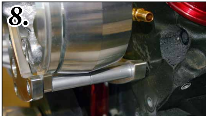
Fig. 8. Install the power steering pump (P304 or P9600) to the main bracket (21266-A or 21241-A) by stacking the two Spacers \frac{3}{8} x 1.680 (TP3-1.680) and \frac{3}{8} x 1.890 (TP3-1.890) together between the pump adapter (21074-A) and the rear support bracket (21262-A) using a \frac{3}{8} x 4\frac{3}{4} " SHCS (S277) to install the pump. If additional length is needed use supplied washers.